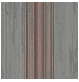
CUSTOM Garnet, Gold