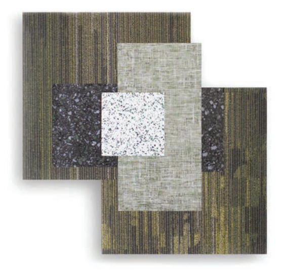
Palette: Prosigns Tint 946, Umpteen Tone 946, Optic Hues 759, Terazzo 986, Creative Terrain 746