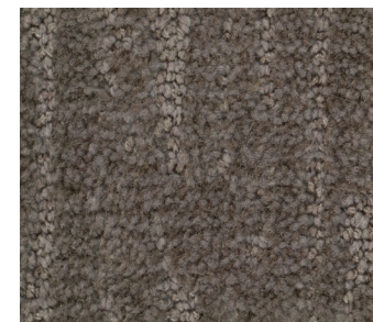
BLEACH with PDI on Chloraguard Enhanced Nylon