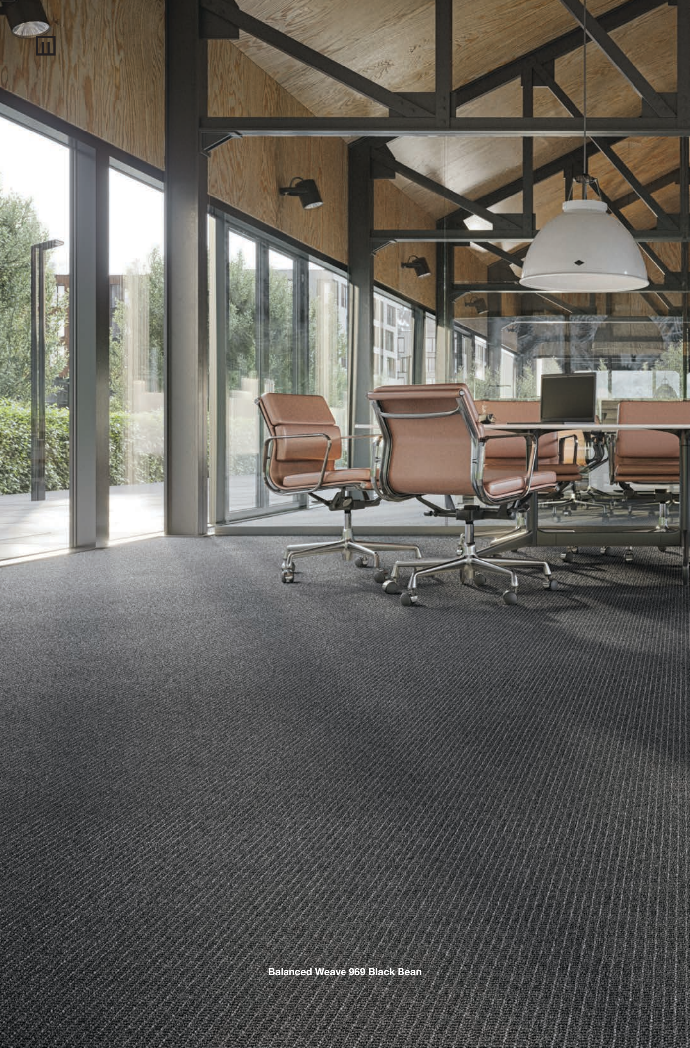
Balanced Weave 969 Black Bean