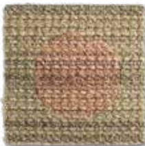
Competitor Solution Dyed / Yarn Dyed Blend