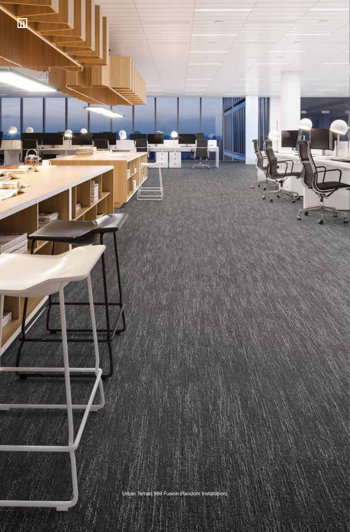
Urban Terrain 969 Fusion (Random Installation)