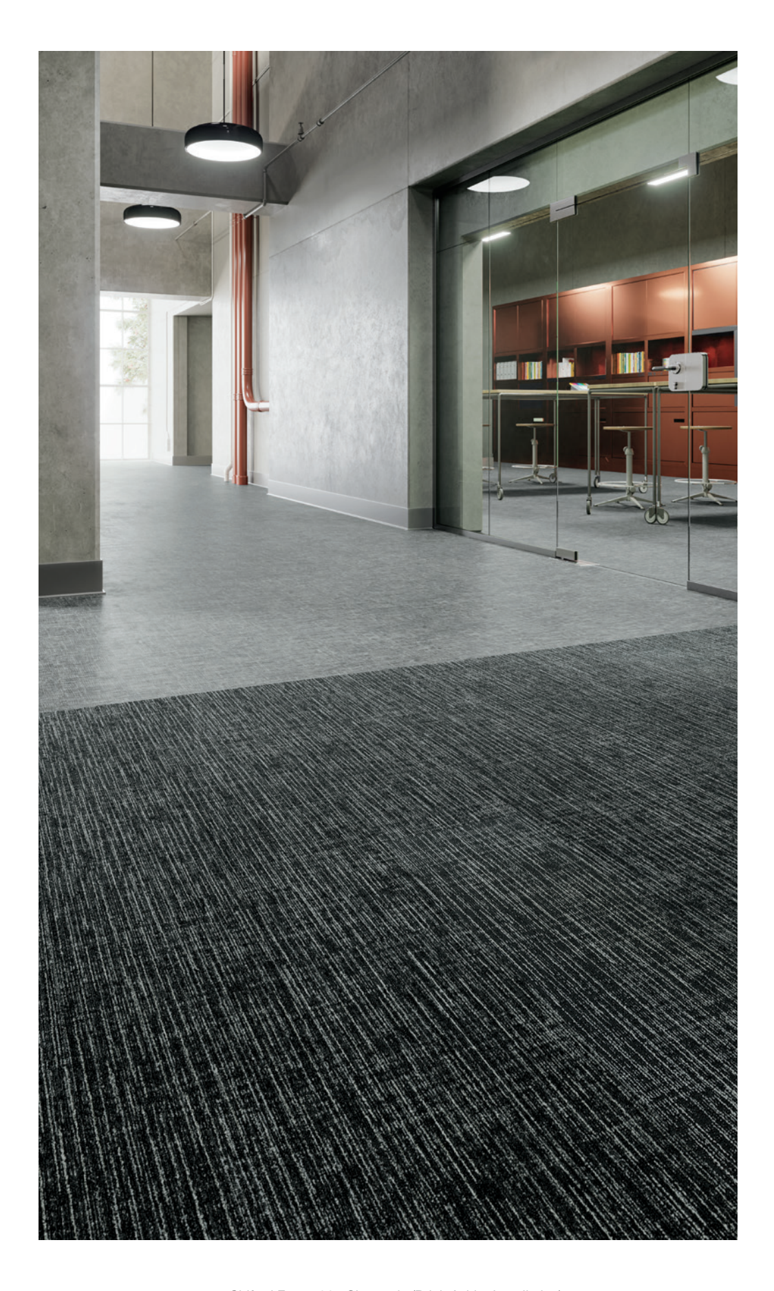
Shifted Focus 987 Cinematic (Brick Ashlar Installation)