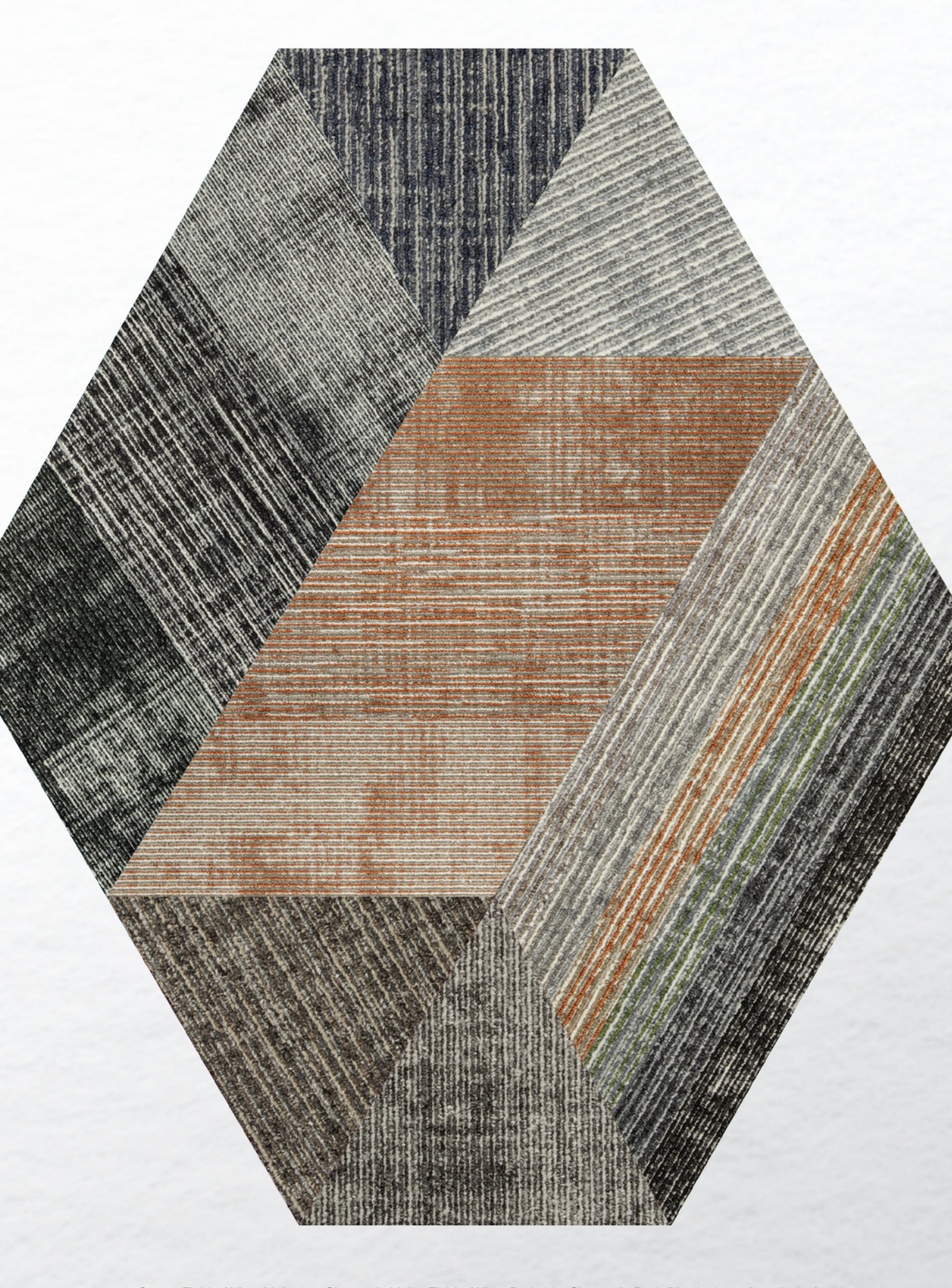
Cover: Field of View Light 987 Cinematic Light, Field of View Dark 987 Cinematic Dark (Herringbone Installation)