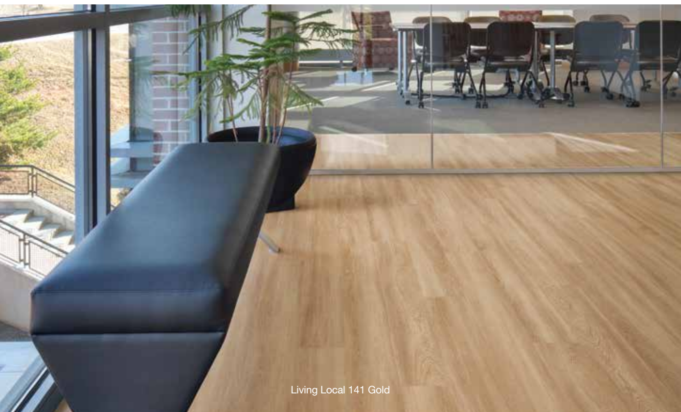
Living Local 141 Gold