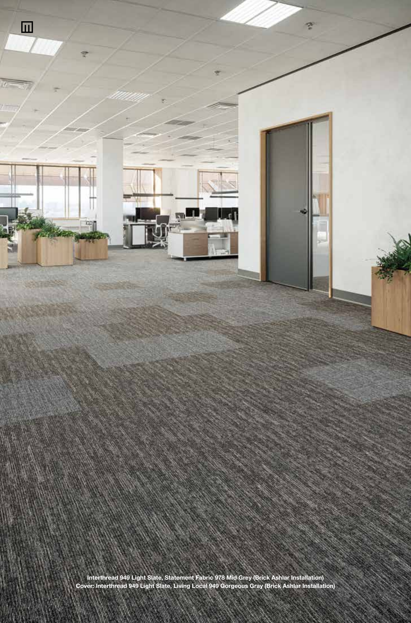
Interthread 949 Light Slate, Statement Fabric 978 Mid Grey (Brick Ashlar Installation) Cover: Interthread 949 Light Slate, Living Local 949 Gorgeous Gray (Brick Ashlar Installation)