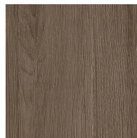
Umber Oak Color: 868