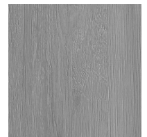
Smoked Oak Color: 949