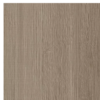
Cocoa Oak Color: 848