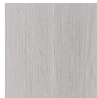
Cloud Oak Color: 917