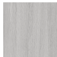
Cloud Oak Color: 917