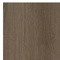
Umber Oak Color: 868