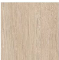
Canvas Oak Color: 811