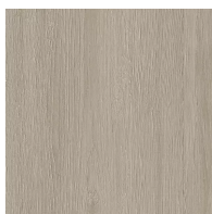
Harvest Oak Color: 828