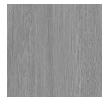
Smoked Oak Color: 949