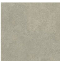
Moon Walk Color: S142