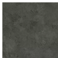
Charcoal Grey Color: S928