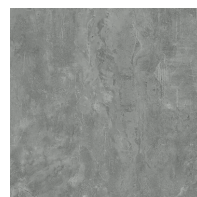
Stormy Nights Color: S999